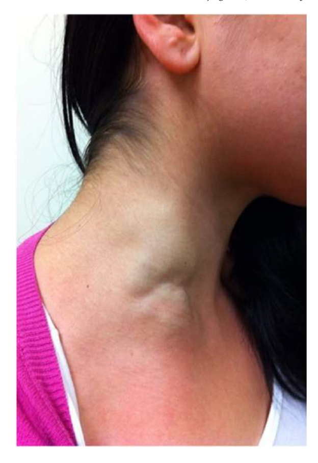
Fig. 1. External jugular vein aneurysm of a 19-year-old woman.