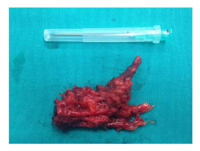
Fig. 4. Macroscopic aspect of the excised external jugular vein aneurysm.

In the differential diagnosis of a cervical mass, cystic hygroma, cavernous hemangioma, a lymphocele, a laryngocele, an enterogenous cyst, thyroid swelling, lymphadenopathy, a thyroglossal cyst, a dermoid cyst and a branchial cleft cyst should be considered.<sup>4,5</sup> Engorgement of the neck swelling during strain eliminates others than a laryngocele and jugular vein aneurysm. The absence of air inside the lesion on plain roentgenography further eliminates the laryngocele.<sup>4</sup>