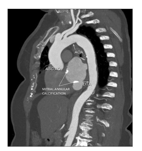
Figure 3: Preoperative computed tomography pulmonary angiogram showing posterior annular calcification of mitral valve

chambers were connected through a restricted, calcified communication across membrane. After complete excision of the membrane, mitral valve was examined. Both mitral commissures were fused. There was a pinhole mitral valve orifice. Posterior annular calcification was present, which was underestimated preoperatively. Subvalvular apparatus was abnormally shortened. Mitral valve was excised and replaced with 25-mm St. Jude Master's series mechanical prosthesis.