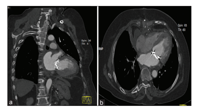
Figure 4: (a and b) Postoperative contrast-enhanced computed tomography thorax showing no residual membrane with mitral valve prosthesis in situ