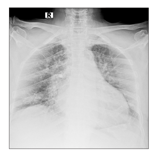
Figure 1: Preoperative chest radiograph showing prominent bronchovascular markings

A large membrane was dividing the left atrium into two compartments posterosuperior and anteroinferior. Both